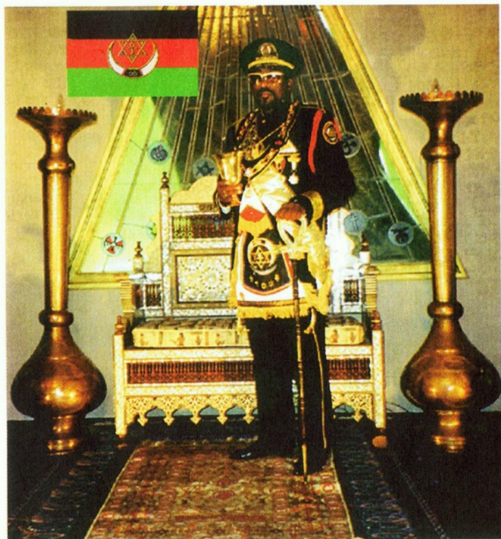
President Of The Yamassee Tribe Of Native Americans The United Nuwaubian Nation Of Moors The Supreme Grand Master Nayya: Malachi Zodok York-El